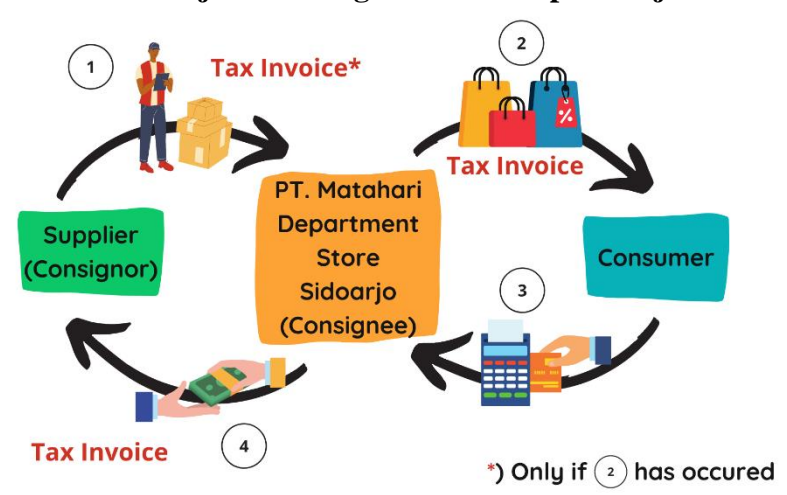
Picture 2 Illustration of VAT Imposition on Consignment at PT. Matahari Department Store Sidoarjo according to the UU Cipta Kerja

Source: processed from Rahmawati dan Shofianti (2014)