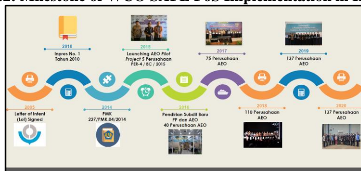
Picture2: Milestone of WCO SAFE FoS Implementation in Indonesia

The real steps for implementing SAFE FoS, especially in the AEO certification program, are described in the following milestones. Indonesia has just completed the standardization of AEO standards as stipulated in PMK number 227/PMK.04/2014 concerning Authorized Economic Operators, which at the same time revoked the provisions of PMK number 219/PMK.04/2010. The AEO certification program was effectively launched in March 2015 with the enactment of the Regulation of the Director General of Customs and Excise number PER-4/BC/2015 concerning Procedures for Granting Customs Recognition as an Authorized Economic Operator.