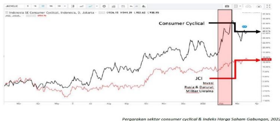
Figure 1. Graph of Consumer Cyclicals Sector Movements

Based on the description above and the inconsistencies found from the results of previous studies. So, the research aimed to ensure the influence of profitability, asset structure, firm size, and corporate governance on the company's stock prices in the consumer cyclicals sector partially and simultaneously, as well as to determine and analyze whether stock returns as a moderating variable can increase or decrease influence of profitability, asset structure, firm size, and corporate governance on stock prices in consumer cyclicals