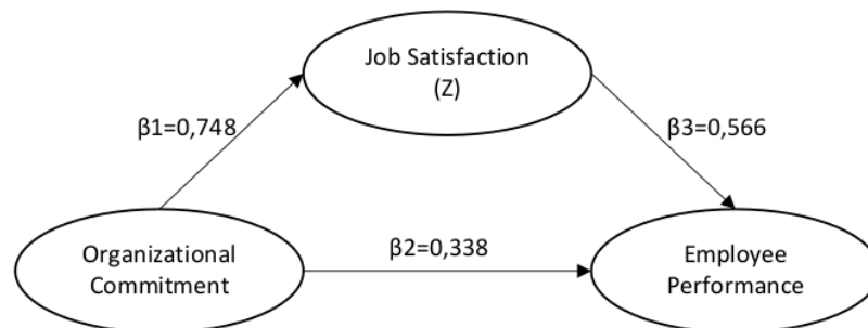
Figure 2 Path Analysis

The Effect of organizational commitment on employee performance with Mediation Job satisfaction and mediation testing in this study is described in Figure 2.