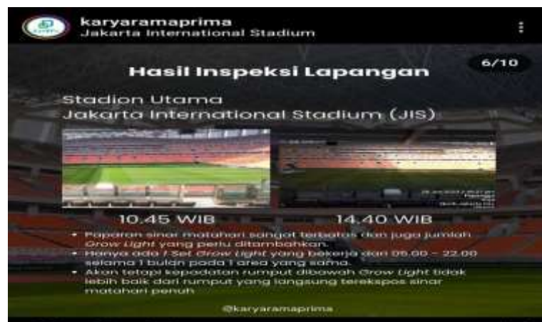
Figure 2 Hasil Inspeksi Mengenai Sinar Matahari

Pt. Karya Rama Prima assessed that in its inspection, out of the 5 points obtained the fourth point was the one at issue, namely the grass roots which were too short 2.5 cm making it difficult to penetrate the synthetic carpet. In addition, PT Karya Prima also commented on the inclusion of sunlight that had not been maximized (Mustakim, 2023).