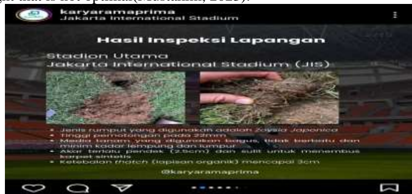
Figure 1 Hasil Insepksi Rumuput JIS

The Jakarta International Stadium was built with a futuristic design and, at the same time, is the grandest and largest stadium building in Indonesia and even Southeast Asia (Hanif, 2022). However, lately, JIS has been judged separate from FIFA standards by the Minister of Public Works and Public Housing, the Chairperson of PSSI, and the Heads of PT. Karya Rama Prima is a local company trusted by FIFA to manage the grass for the U-20 world cup preparation stadium. Qamal Mustaqim, led by PT. Karya Rama Prima assesses two main problems, namely regarding the sun that does not enter optimally to illuminate the stadium grass and grass roots that do not grow optimally by around 2-3 cm due to the media being too thick and sunlight that is not optimal (Mustakim, 2023).